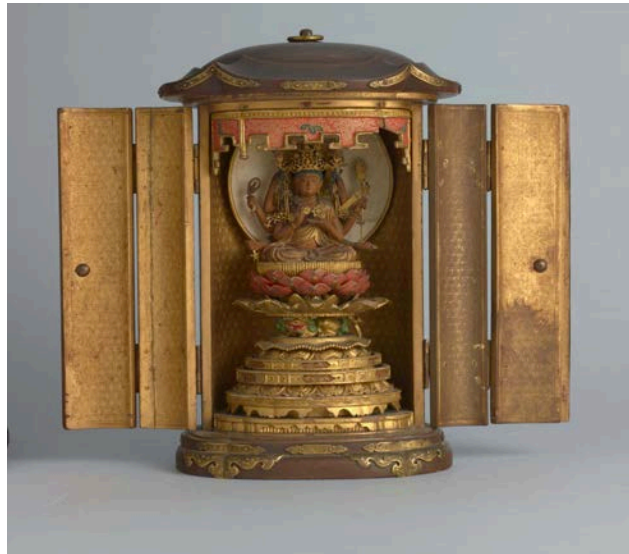
Japan, Buddhist Shrine, Bates College Museum of Art, Marsden Hartley Memorial Collection, Gift of the Marsden Hartley Estate, 1951.2.86