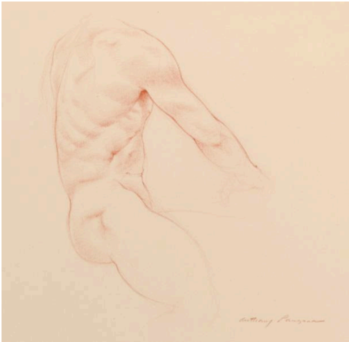
Anthony Panzera, Male Nude Torso , Bates College Museum of Art, gift of the Artist, 1995.3.2

BIO 204- Biological Research Experience: Molecules to Ecosystems: 7