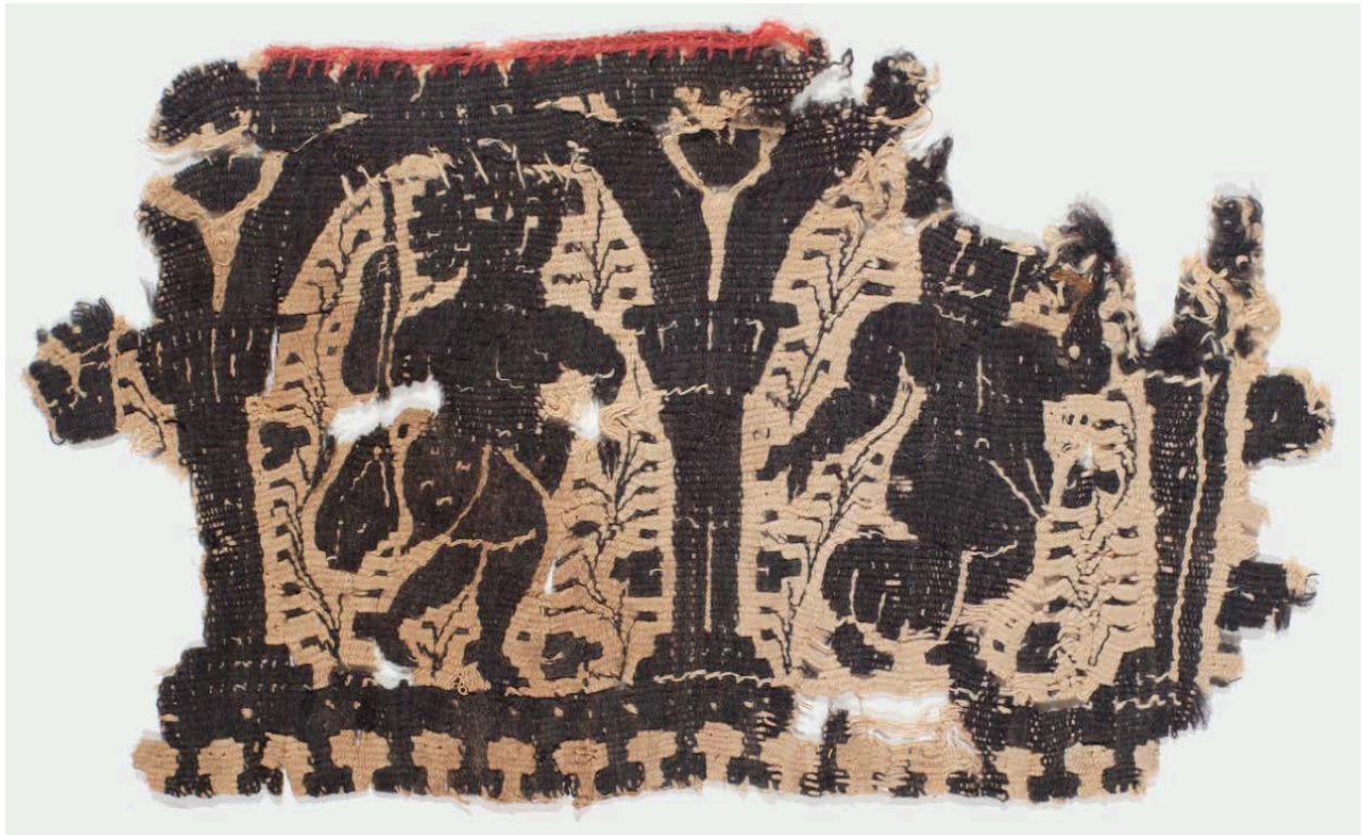
Panel with Bacchic Dancers, Bates College Museum of Art, Marsden Hartley Memorial Collection, Gift of the Marsden Hartley Estate, 1951.2.75.w