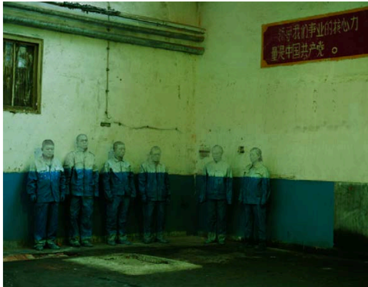
Liu Bolin, Laid Off , Museum Purchase with support from the Robert and Minna Johnson Art Acquisition Fund, 2006.9.1

CHI 102- Beginning Chinese II: 7 CHI 202- Intermediate Chinese II: 7 CHI 223- Communism, Capitalism, and Cannibalism: New and Emerging Voices in Chinese Literature: 7 CHI 302- Upper-Level Modern Chinese II: 7 CHI 405- Special Topics in Advanced Chinese: 7 CHI 458- Senior Thesis: 7