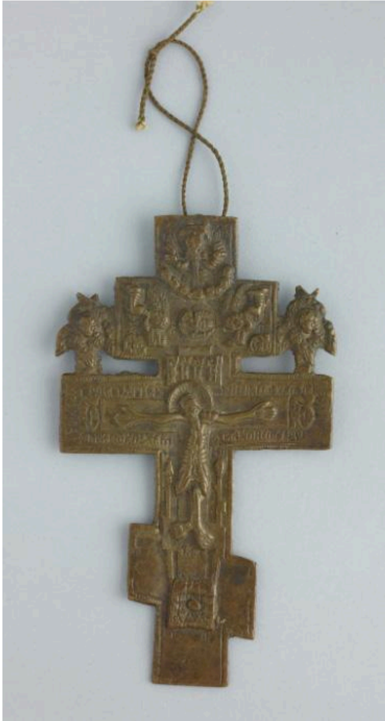
Old Believer Icon of the Crucifixion, Bates College Museum of Art, Marsden Hartley Memorial Collection, Gift of the Marsden Hartley Estate, 1951.2.13